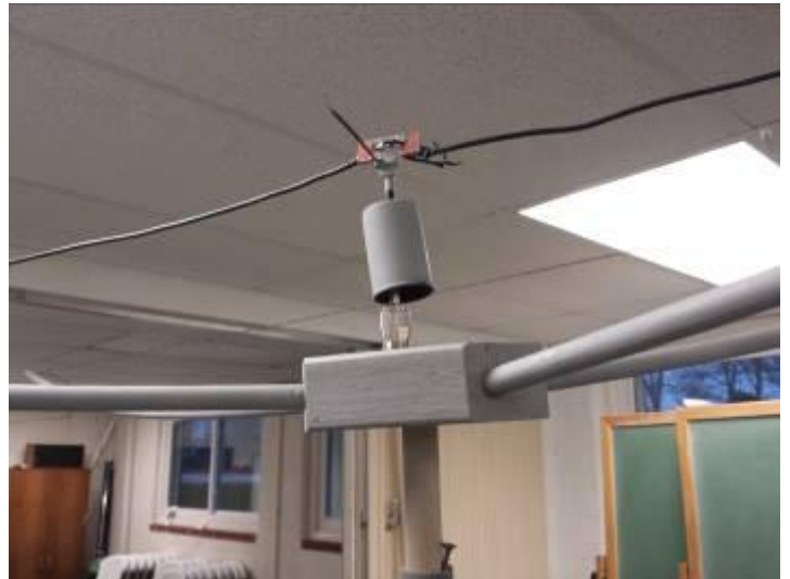
Close up view of center