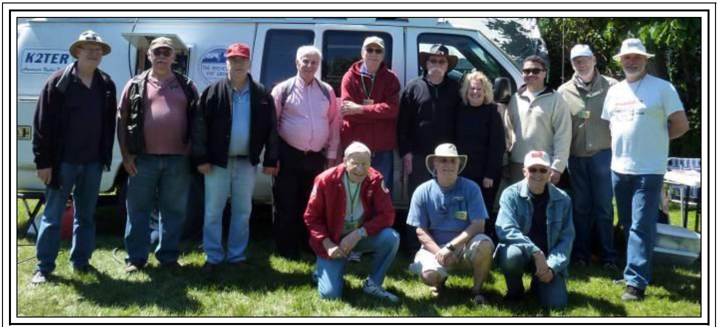
Rochester VHF Group at the 2015 Rochester Hamfest