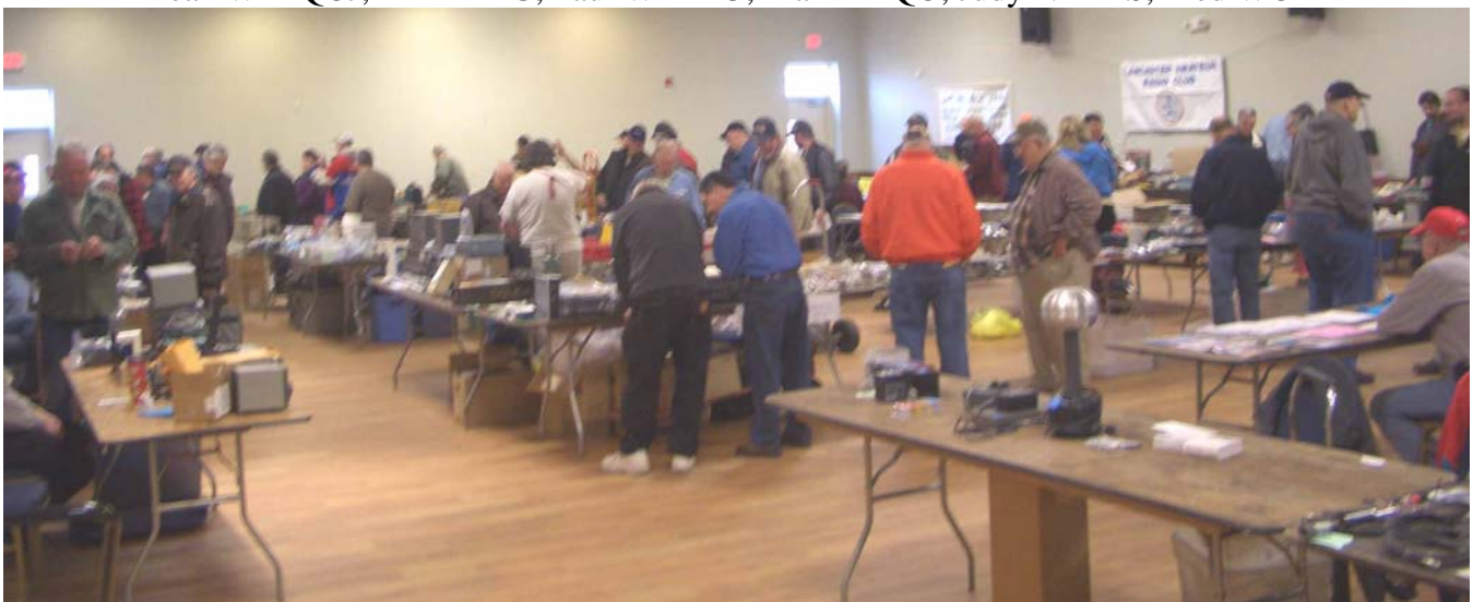
This is a view of the selling floor.